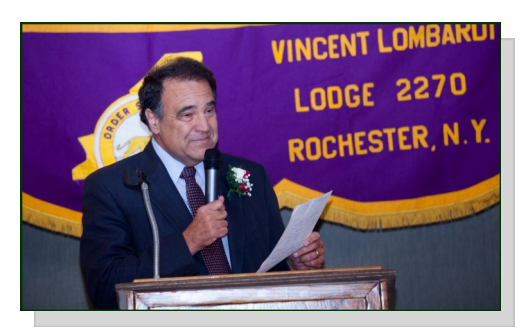
2016 Christopher Columbus Italian American Heritage Awards Dinner