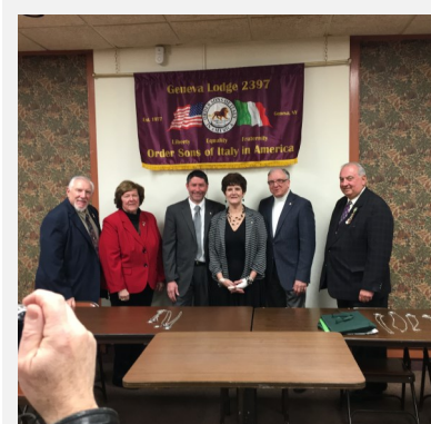
Geneva Lodge Installation