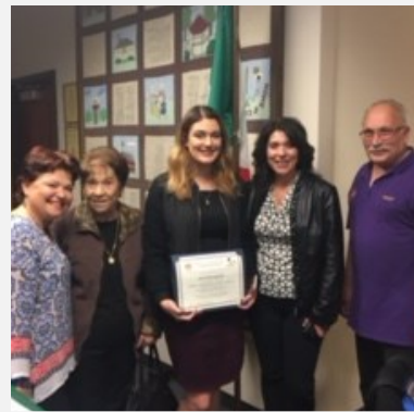
Bella Lingua Award Ceremony