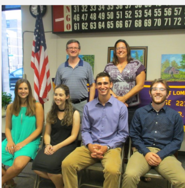
Scholarship Awards Night