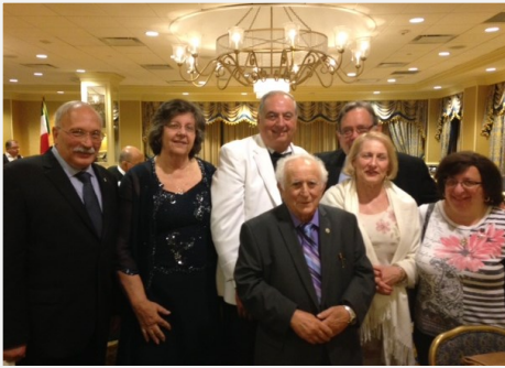
NYS Grand Lodge Convention