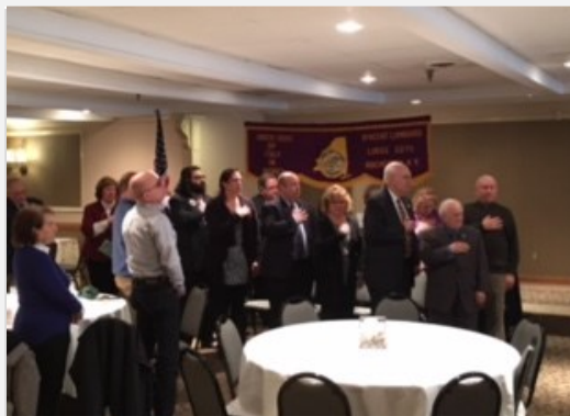
Officer Installation Brunch